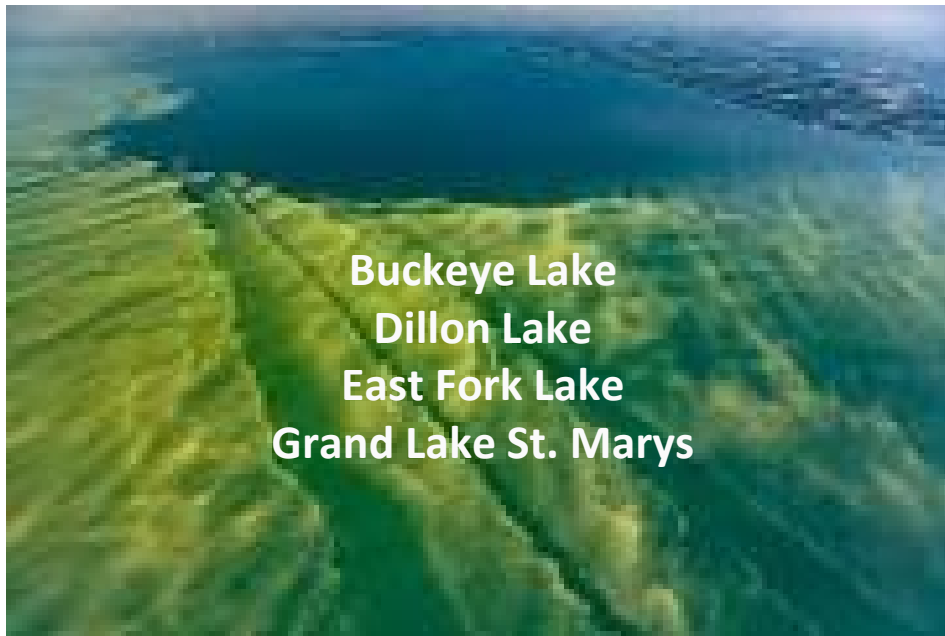
Buckeye Lake Dillon Lake East Fork Lake Grand Lake St. Marys

Focused on other regions in the state experiencing harmful algae blooms and other water quality challenges