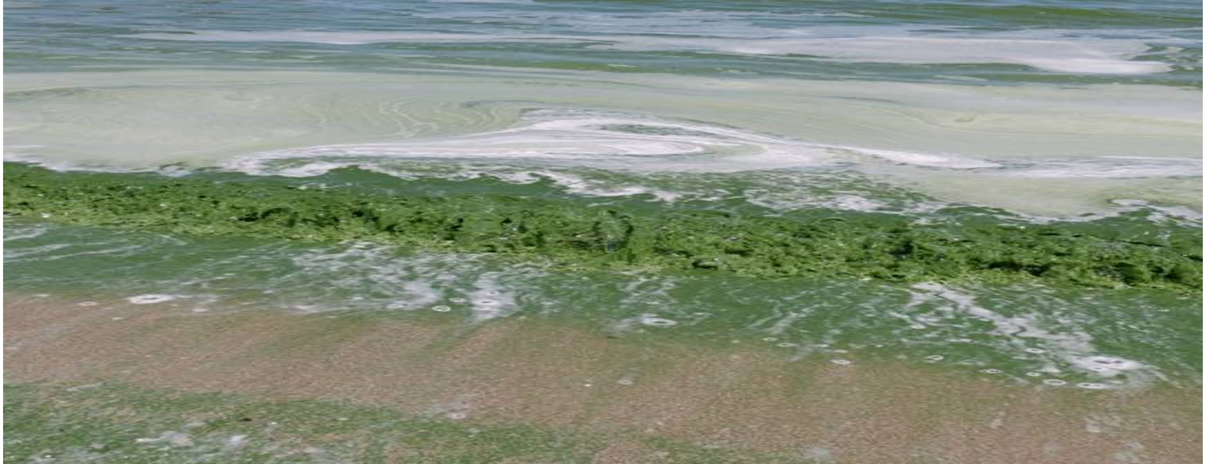
Maumee Bay State Park, August 14, 2019