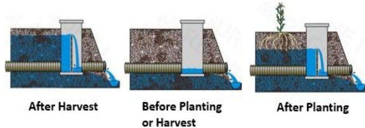
Water Retention Reservoir